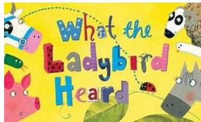
What the ladybird heard

https://www.youtube.com/watch?v=SW-7MgHEZOE